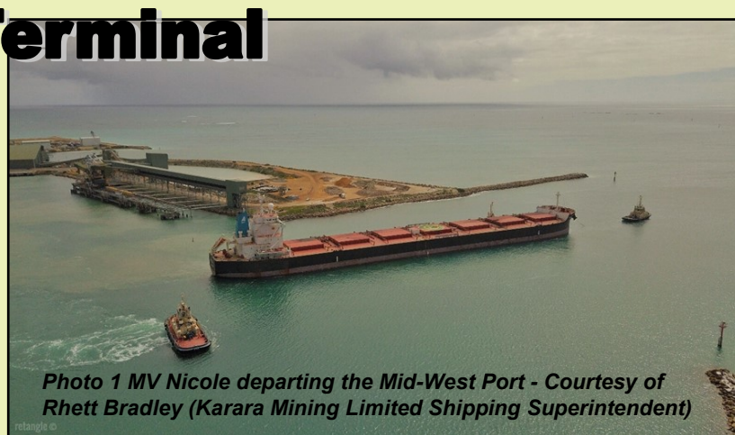
Photo 1 MV Nicole departing the Mid-West Port

Karara are now planning to increase annual export tonnes which will bring benefit to the Mid-West for all of Karara major contractors and suppliers.